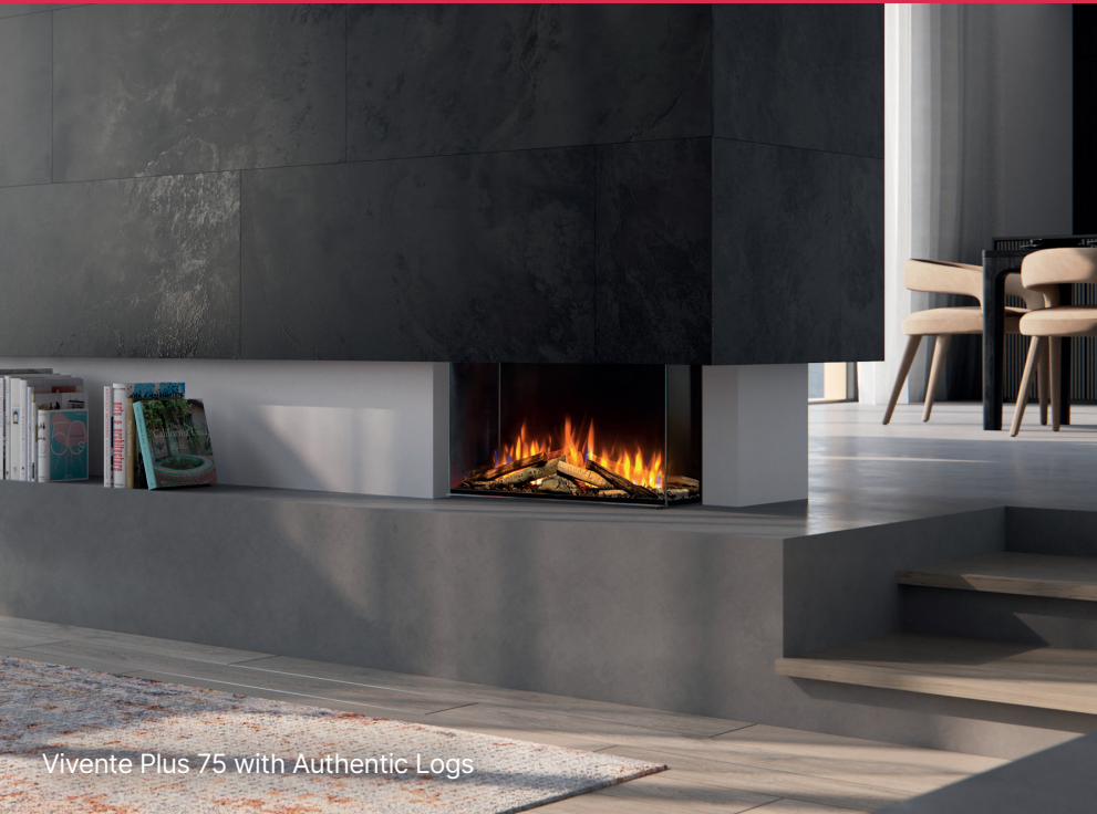
Vivente Plus 75 with Authentic Logs